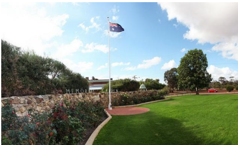
Kondinin Memorial Garden